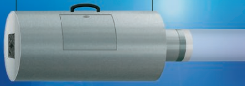
"Eventmachine" Also for rent.