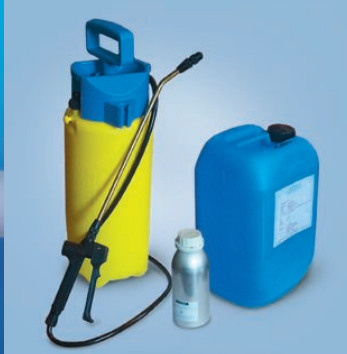
2. The active component comes in appropriate lot sizes.