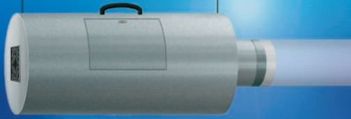
1. "Eventmachine". Also for rent. Ideal for bringing the active component into the work place. Without interruption of the task.