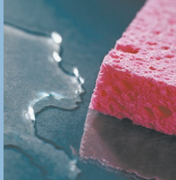
3. Can be added to cleaning-water. An everyday order absorber.